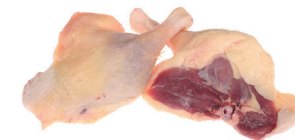
Goose Legs - December