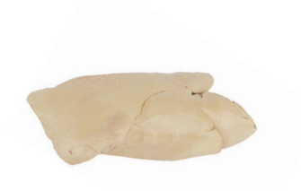
Goose Foie Gras Extra A