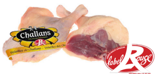
Ernest Soulard Challans Duck Legs