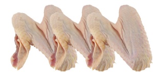
Skeaghanore Irish Duck Wings