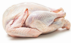
Skeaghanore Goose & Giblets - December