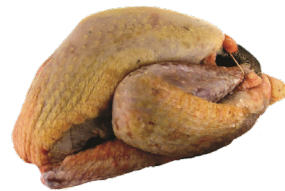
Guinea Fowl Oven Ready