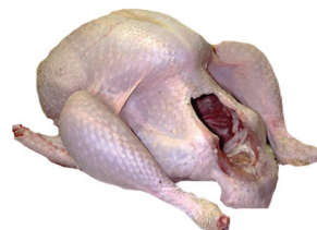
Free Range Bronze Turkey - December