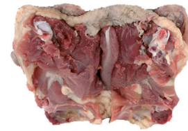
Squab Pigeon Spatchcock