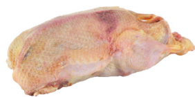
Ernest Soulard Croisé Duck