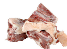
Ernest Soulard Duck Bones