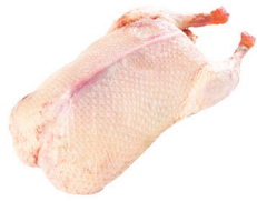
Skeaghanore Irish Duck - Whole