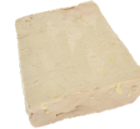
Foie Gras Sheet