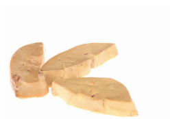
Duck Foie Gras Escalope