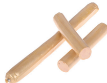
Duck Foie Gras Ficelle Prestige