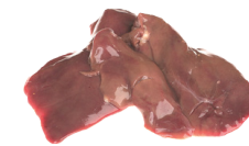
Ernest Soulard Organic Duck Livers IQF