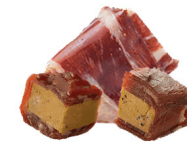
Duck Foie Gras & Magret Bonbons