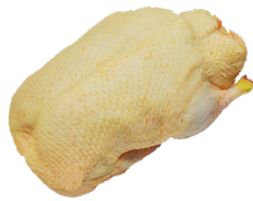
Ernest Soulard Organic Whole Duck