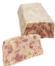
Duck Opera Confit & Foie-Gras Terrine