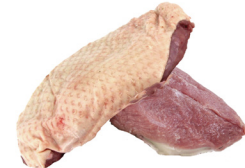
Ernest Soulard Barbary Duck Breast (M)