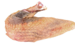
Guinea Fowl Supremes