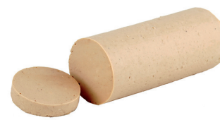
Duck Foie Gras Caprice