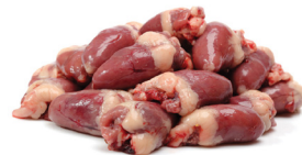
Skeaghanore Irish Duck Hearts