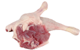
Skeaghanore Irish Duck Leg