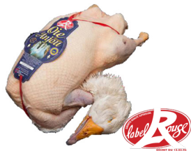
Free Range Goose Effilée