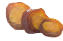
Date stuffed with Foie Gras