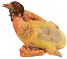
Squab Pigeon Effilée