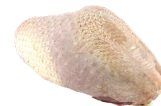
Irish Turkey Breast - Butterfly Skin-On