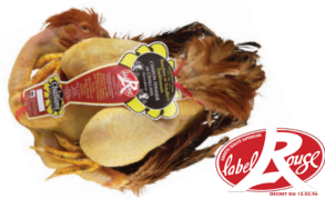
Free Range Guinea Fowl Capon Effilée