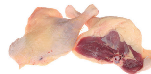
Ernest Soulard Barbary Male Duck Leg