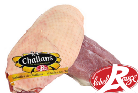
Ernest Soulard Challans Duck Breast