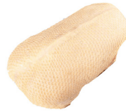
Skeaghanore Duck Crown