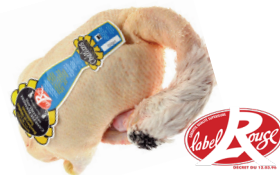
Ernest Soulard Challans Duck Effilée