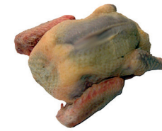
Squab Pigeon Oven Ready