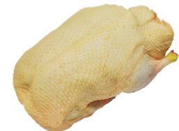
Ernest Soulard Organic Duck Oven-Ready