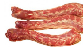
Ernest Soulard Duck Neck