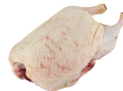
Ernest Soulard Barbary Duck