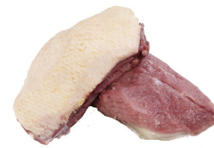
Skeaghanore Irish Duck Breast