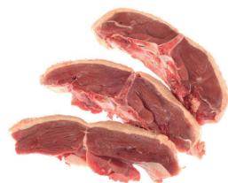
Ernest Soulard Duck Ribs IQF