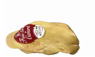
Duck Foie Gras Extra - Deveined