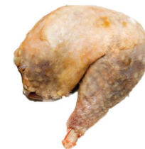
Free Range Guinea Fowl Legs