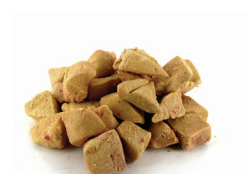
Duck Foie Gras Pieces