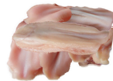
Skeaghanore Duck Neck