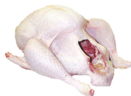
Free Range Oven Ready Turkey