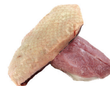
Ernest Soulard Barbary Duck Breast (F)