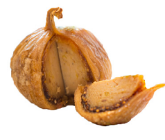
Fig stuffed with Foie Gras