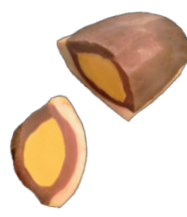
Duck Breast Cured stuffed w/ Foie Gras