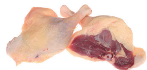
Ernest Soulard Large Duck Legs