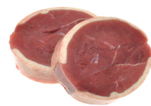
Ernest Soulard Duck Tournedos