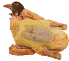
Squab Pigeon Au Sang - With Blood