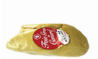
Duck Foie Gras Extra - Vac-Pack