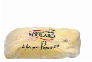
Duck Foie Gras Extra - Trousse