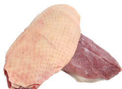
Ernest Soulard Magret Duck Breast