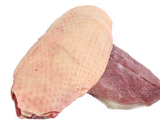
Goose Breast - Magret - December