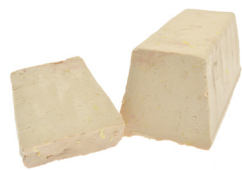
Duck Foie Gras Terrine